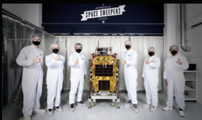
Astroscale executives pose with ELSA-d, the spacecraft that validated their business in March 2021.

But obtaining a launch license for ELSA-d was challenging. Without a propulsion system, the dummy satellite was essentially a brick in space – and few countries were willing to take on the risk. After rejections from nine governments, Astroscale finally obtained a green light from the United Kingdom.